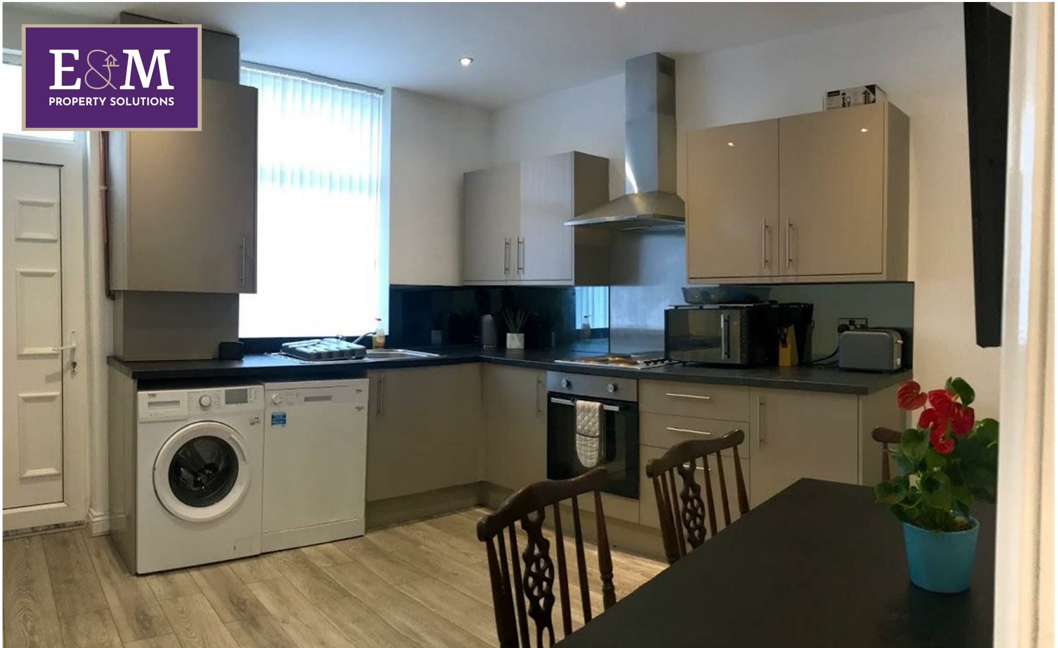
Room 2, 48 Heath Street, Burnley, Lancashire, BB10 3BL £140 Per week